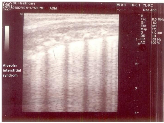
Figure 1. Lung Ultrasound showed Alveolar interstitial syndrome with pleural line abnormalities, A-lines disappeared in full-term neonates with TTN.

1. neonates. Neonatology. 2019;115(1):77-84.