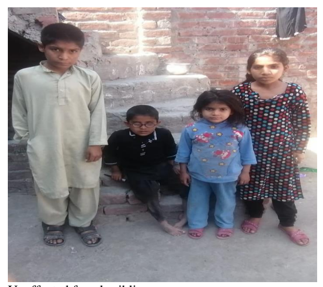
Unaffected female siblings