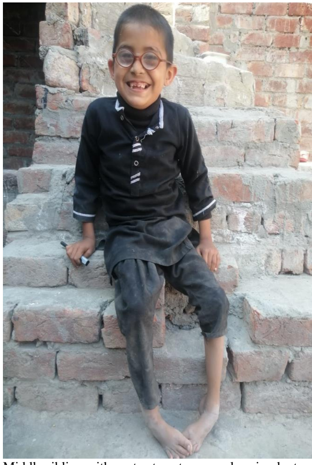
Middle sibling with post cataract surgery lens implant